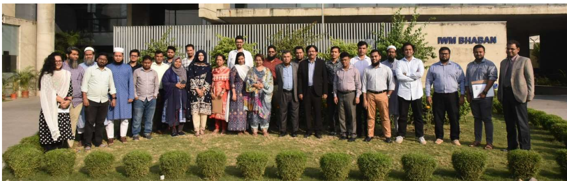
Participants and IWM management in front of IWM Bhaban