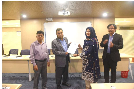
Participant receiving certificate of participation from the Executive Director, IWM

According to the feedback received from the participants, the training program was highly beneficial to them as it included lot of case studies and real-life examples and modelling tools for water quality, air quality and noise. On completion of the program, certificates were distributed among the participants by the management of IWM. IWM looks forward to organizing such training programs on a regular basis.