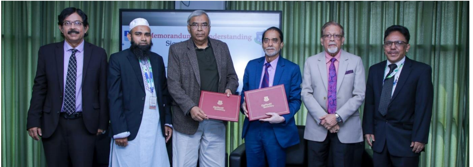
MoU signing between Daffodil International University (DIU) and Institute of Water Modelling (IWM)

Daffodil International University (DIU) and Institute of Water Modelling (IWM) signed a Memorandum of Understanding (MoU) on Monday, 26 December, 2021 to formulate and develop research/study projects and carry out scientific researches and project-based studies in the common field of operation of both the organizations as and when appropriate.